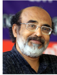
Sri. Thomas Issac Hon'ble Minister for Finance