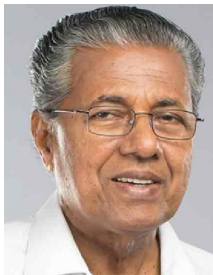
Chairman Sri. Pinarayi Vijayan Hon'ble Chief Minister